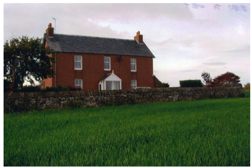
Fig. 2. Rameldry, Kettle Parish, Fife